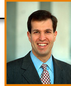
Ken Mehlman Former Chairman of the Republican National Committee

"Committed, monogamous couples are the ingredients that help to build strong families, strong communities, and a strong nation. As a Republican, I believe we need to focus more on these conservative values to broaden support for allowing gay couples to marry. The Commitment Campaign will help bring a new voice to the debate and remind us that commitment and fidelity are the traditional principles to which gay couples are seeking to adhere by joining the tradition of marriage."