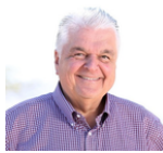
Governor Steve Sisolak (D) Elected in 2018